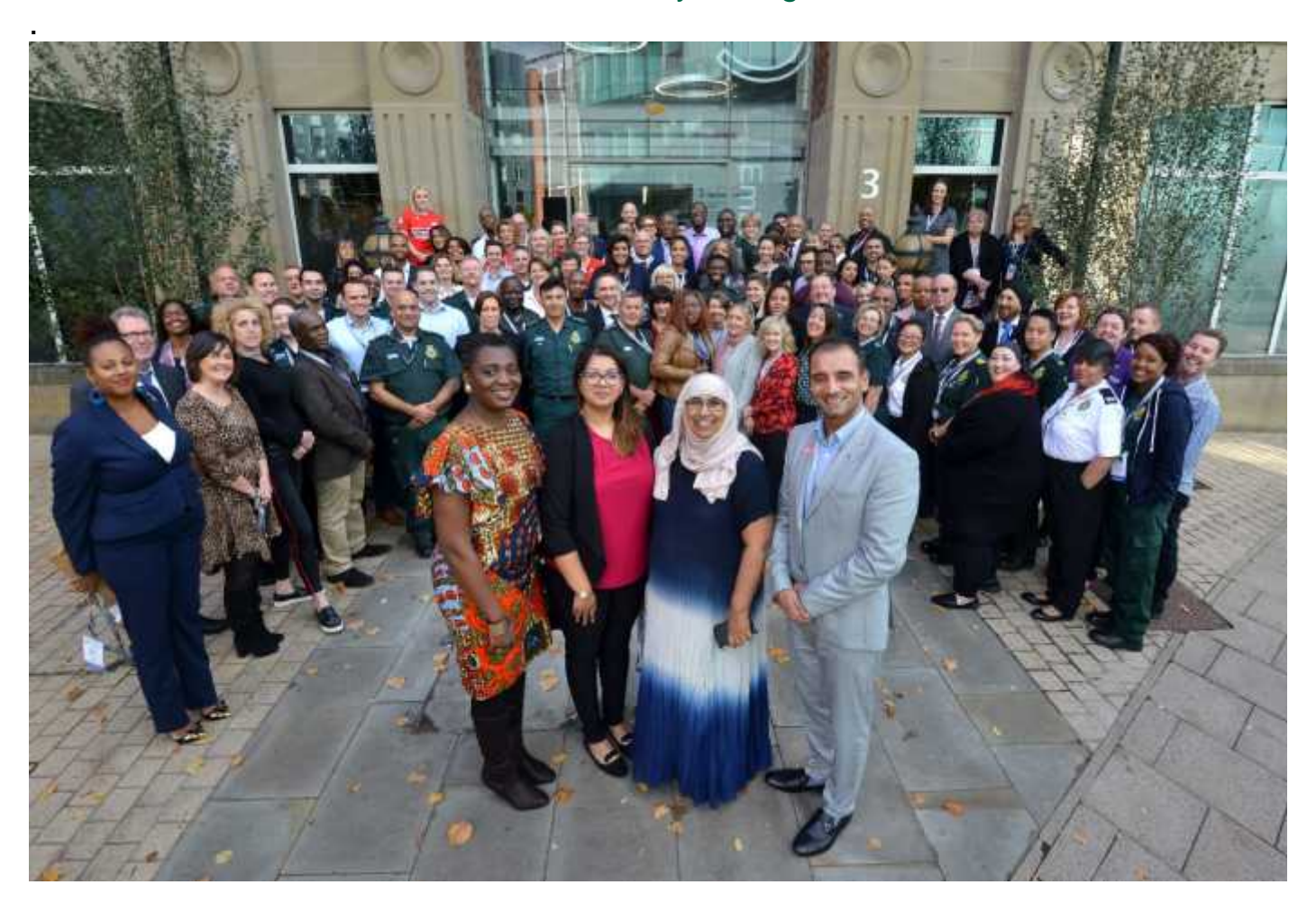
Conference 2018, Leeds

We'd like to thank you for joining us for today's event and hope that you will find it useful, inspiring and that it helps you identify good practice that you can take back into your organisation.